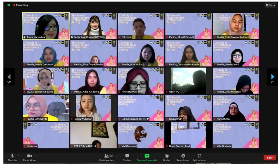
Photo 1 & 2: Participants in The Role of Physiotherapy in Maternity Setting by colleagues from Indonesia